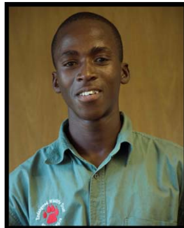
Members of the Rural Eco-Warriors