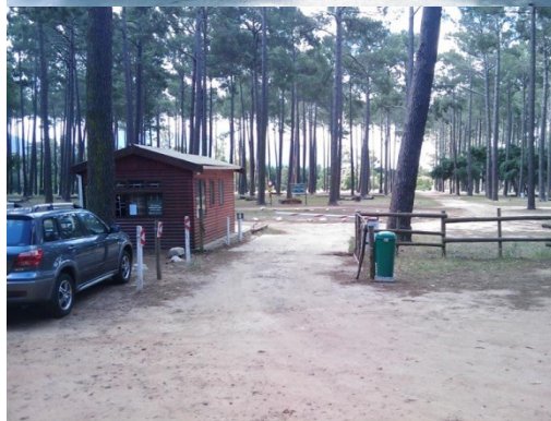
Exit point with booms.