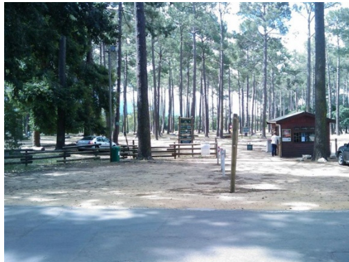
Entry point with booms and manual payment system.

The vehicle access to the braai/ picnic site is currently gated with booms and entrance hut which is operated by the gate management service provider. Visitors to the site must pay a permit fee on arrival at the boom gates to the access agency staff. A single entry and exit lane currently exists. On extreme busy days, both entry and exit lanes are used to enter the site which is manned by 2 or 3 access agency staff. Queues are sometimes experienced on entry into the braai/ picnic site which could be attributed to the manual handling of cash payment for permits (human factor).