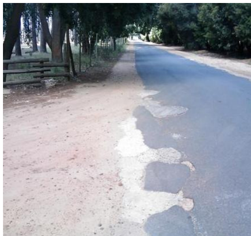
Edge of roadway along Tokai Road in the vicinity of the braai/ picnic site in disrepair do to vehicle usage.

The existing 'Tokai Road Extension' is a private road, with approximately 4m wide surfacing between Zwaanswyk Road and the Prinskasteel River Bridge. The road is considered very narrow for safe two-way traffic operations and it is recommended that the roadway be widened and resurfaced to 6m. The existing road pavement is also in a very poor condition exhibiting numerous modes of distress such as deformation, cracking and disintegration of the surfacing.