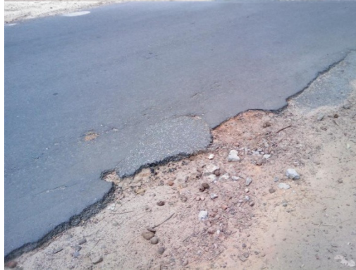
Pavement edge breaking up.